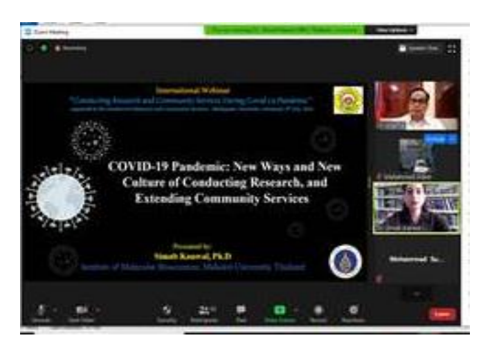
Fig. 7. The first guest speaker delivered her presentation.

During the webinar, each keynote speaker delivered the materials based on current practice on their country.