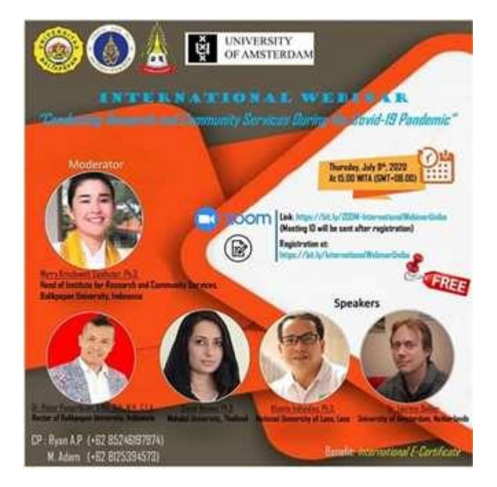
Fig. 2. Flyer distributed to participants on social media such as facebook and whatsapp.