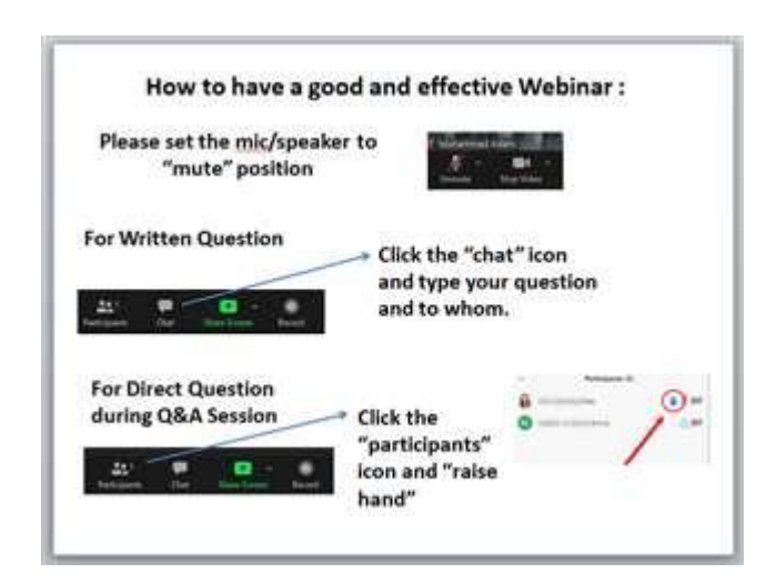
Fig. 6. The brief induction before webinar began.

Right after the webinar was opened, the host provided a brief induction to all participants and speakers to ensure the effective webinar. There were two points to raise, the first was to ensure the participants mic/speaker was set to mute position, and the second point was about the procedure to ask question. One slided was provided during the explanation with the illustration of Zoom features.