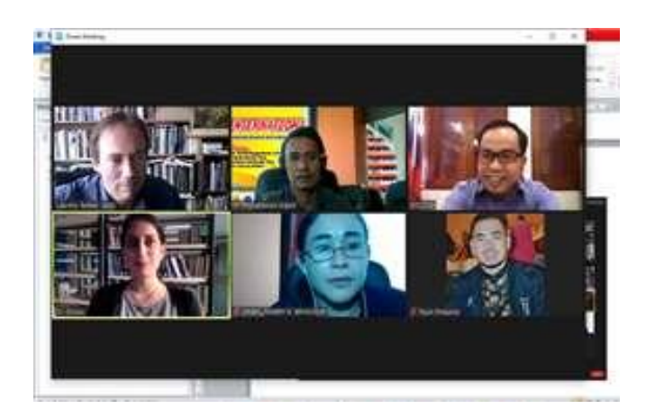
Fig. 5. Simulation session was attended by all guest speakers, host, moderator, and zoom operator.

The webinar was opened by Rector of Balikpapan University and was began on time at 15.00 WITA (GMT +08.00) as scheduled. Rector of Balikpapan University conveyed high appreciation to the three guest speakers and webinar committees, also welcomed all participants.