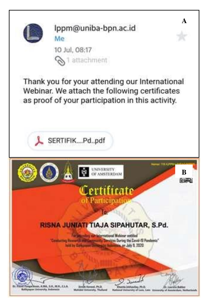
Fig. 10. Example of automatic emailing e-certificate to participants after submitting their attendance (A), example of e-certificate copy received by one of the participants (B).

the webinar. Once the webinar session ended, the committees and speakers spent 20 minutes to oversee an evaluation session.