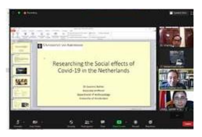
Fig. 9. The third guest speaker presented his talk.

carried out to cope with pandemic. He highlighted the Laos government action in preventing the Covid19 spread, that uptodate, there was no death case in Laos.