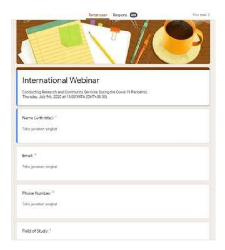
Fig. 3. Application for online registration.

The webinar used Zoom conferencing platform. The reason to choose such a platform was because the application was one of the user-friendly application as asserted by Carman (2020) who agrees that Zoom is easy to use for the users don't need a login to access a meeting and the interface was relatively intuitive. Furthermore, Johsnton (2020) stated that "Zoom is one of the best options for video conferencing if part of your