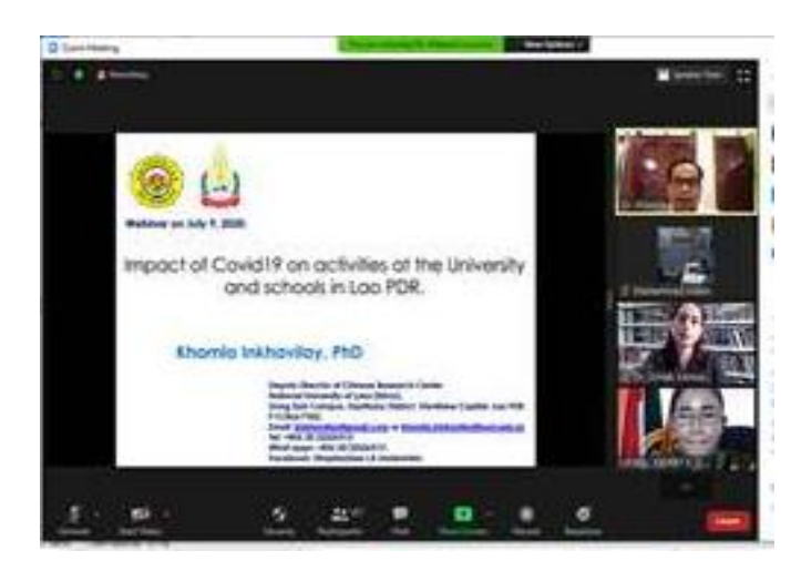
Fig. 8. The second guest speaker extended his address.

Other important point delivered by the first speaker was the need to continue with the community services and it could be started from the little things by helping the neighbourhood, also maintaining communication with family and friends, and supporting each other.