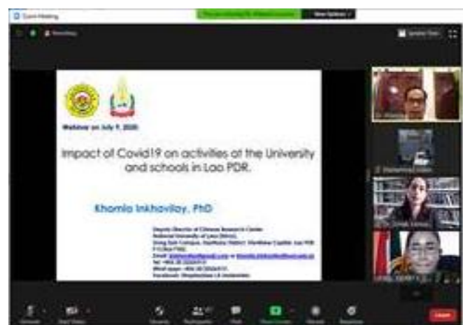
Fig. 8. The second guest speaker extended his address.

Other important point delivered by the first speaker was the need to continue with the community services and it could be started from the little things by helping the neighbourhood, also maintaining communication with family and friends, and supporting each other.