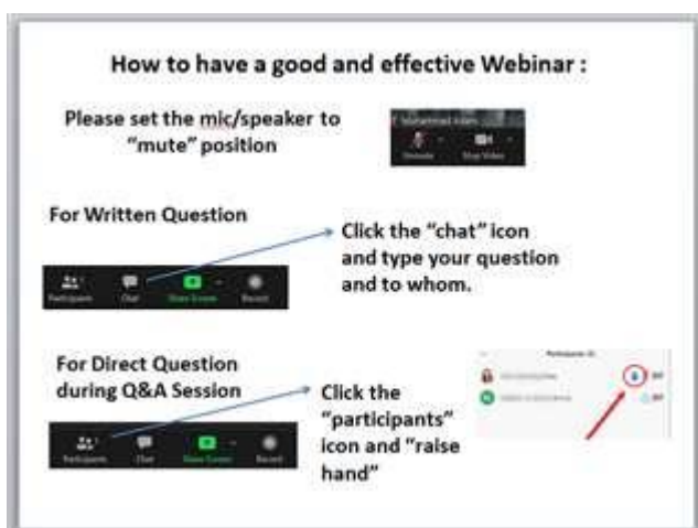
Fig. 6. The brief induction before webinar began.

Right after the webinar was opened, the host provided a brief induction to all participants and speakers to ensure the effective webinar. There were two points to raise, the first was to ensure the participants mic/speaker was set to mute position, and the second point was about the procedure to ask question. One slided was provided during the explanation with the illustration of Zoom features.