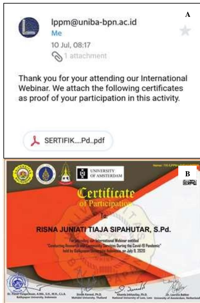
Fig. 10. Example of automatic emailing e-certificate to participants after submitting their attendance (A), example of e-certificate copy received by one of the participants (B).

the webinar. Once the webinar session ended, the commitees and speakers spent 20 minutes to oversee an evaluation session.