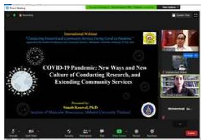
Fig. 7. The first guest speaker delivered her presentation.

During the webinar, each keynote speaker delivered the materials based on current practice on their country.