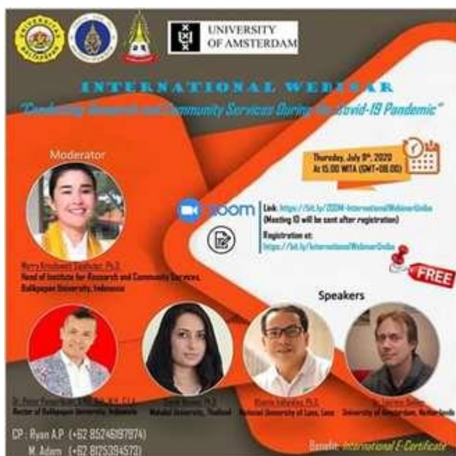
Fig. 2. Flyer distributed to participants on social media such as facebook and whatsapp.