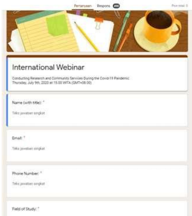
Fig. 3. Application for online registration.

The webinar used Zoom conferencing platform. The reason to choose such a platform was because the application was one of the user-friendly application as asserted by Carman (2020) who agrees that Zoom is easy to use for the users don't need a login to access a meeting and the interface was relatively intuitive. Furthermore, Johnsnton (2020) stated that "Zoom is one of the best options for video conferencing if part of your