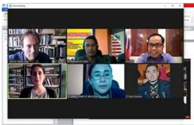
Fig. 5. Simulation session was attended by all guest speakers, host, moderator, and zoom operator.

The webinar was opened by Rector of Balikpapan University and was began on time at 15.00 WITA (GMT +08.00) as scheduled. Rector of Balikpapan University conveyed high appreciation to the three guest speakers and webinar committees, also welcomed all participants.