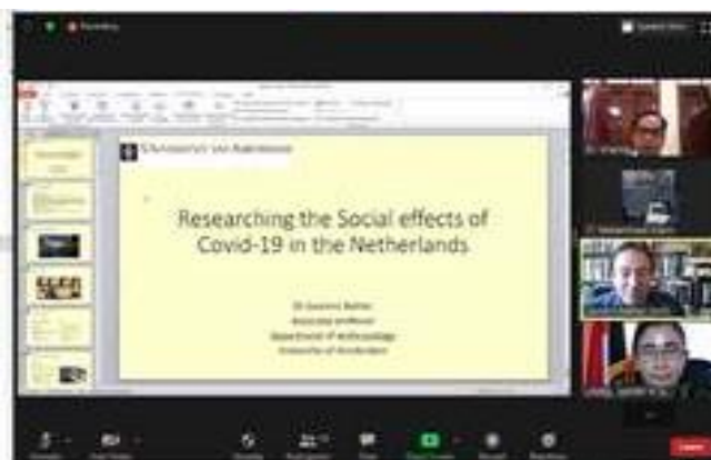
Fig. 9. The third guest speaker presented his talk.

carried out to cope with pandemic. He highlighted the Laos government action in preventing the Covid19 spread, that uptodate, there was no death case in Laos.